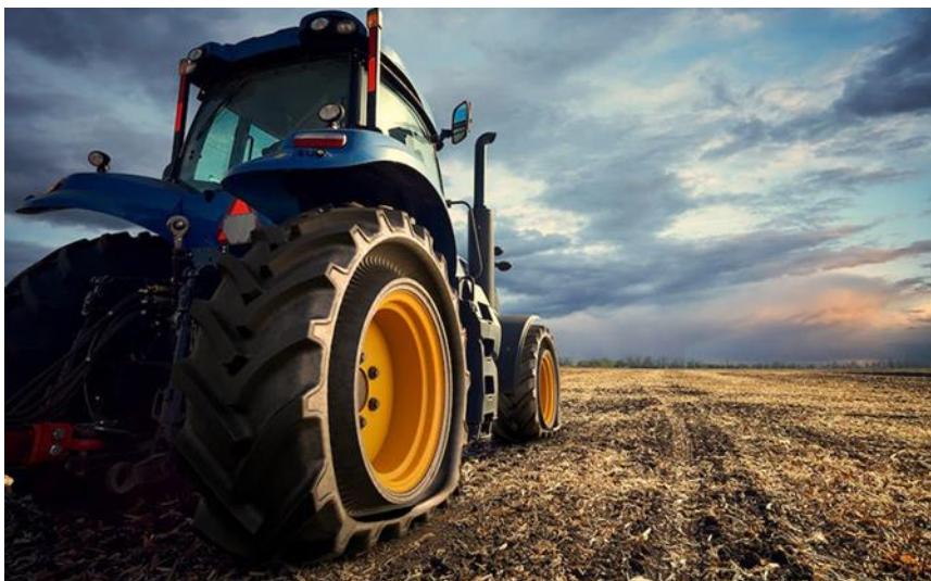
Galileo's Airless “Cup Wheel” Tires

Galileo tires have already been highly evaluated in the market, and demand for airless tires that require less maintenance is expected to increase with the advancement of autonomous driving for the future. Utilizing its global sales and marketing network, Marubeni will support the sales of Galileo’s airless tires developed by Galileo.